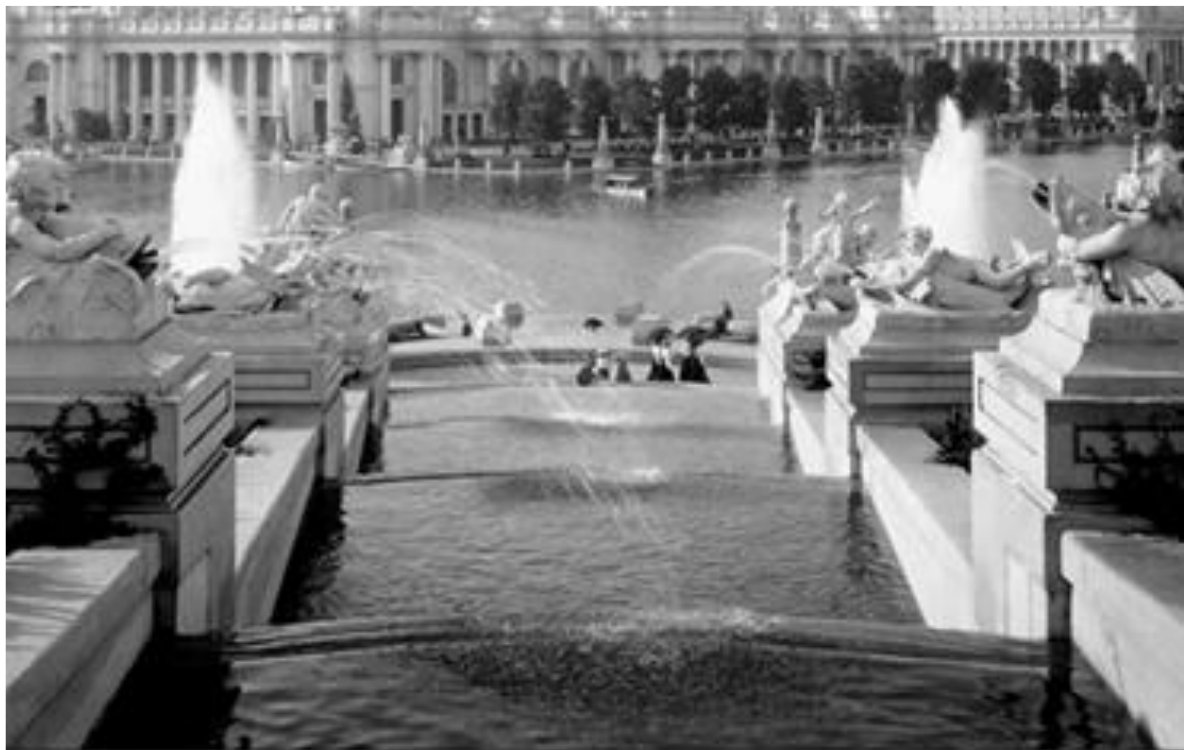
The Cascades across from the Electricity Building

at the St Louis World's Fair in 1904. "The Cascades" Rag by Scott Joplin was about the amazing beauty of the cascades at the World's Fair in St Louis, Missouri.