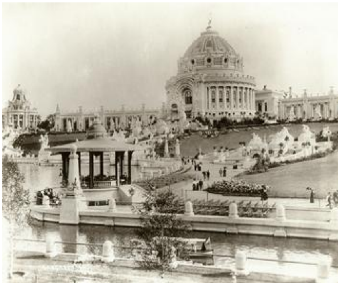
Festival Hall, St. Louis World's Fair. Photograph by Emil Boehl, 1904.