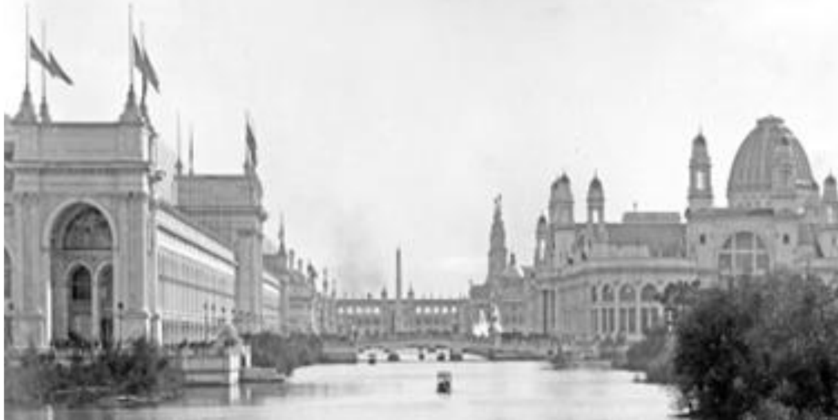
Chicago World's Fair 1893 where many Ragtime performers attended to promote their playing including Scott Joplin.